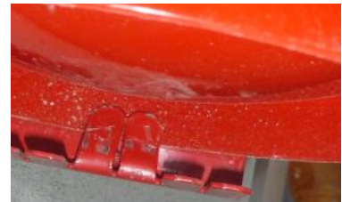
Fingers Grip Base of Extinguisher