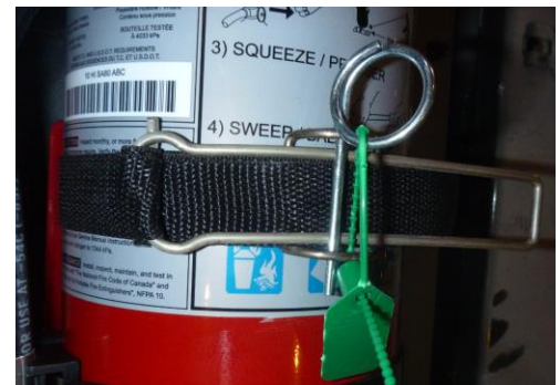
Patented Tension assembly, 300lbs applied tension