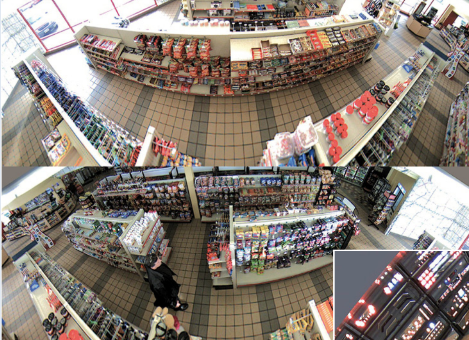
Q24 Hemispheric Camera: Dual-Panorama