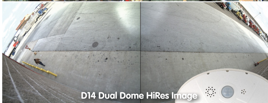
D14 Dual Dome HiRes Image