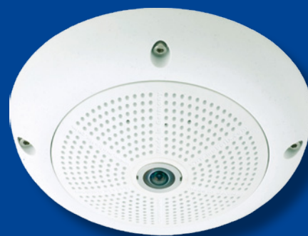
Q24 Hemispheric Camera