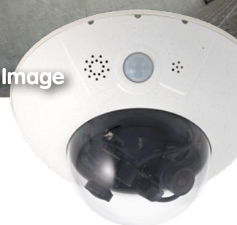
D14 Dual Dome Camera

few cameras and, on top of that, the edge devices are producing high-quality images that leave no room for questions on what occurred."