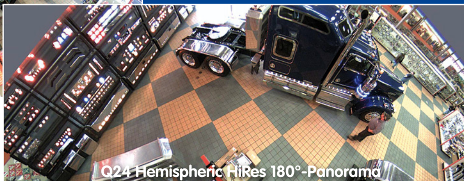
Q24 Hemispheric HiRes 180°-Panorama