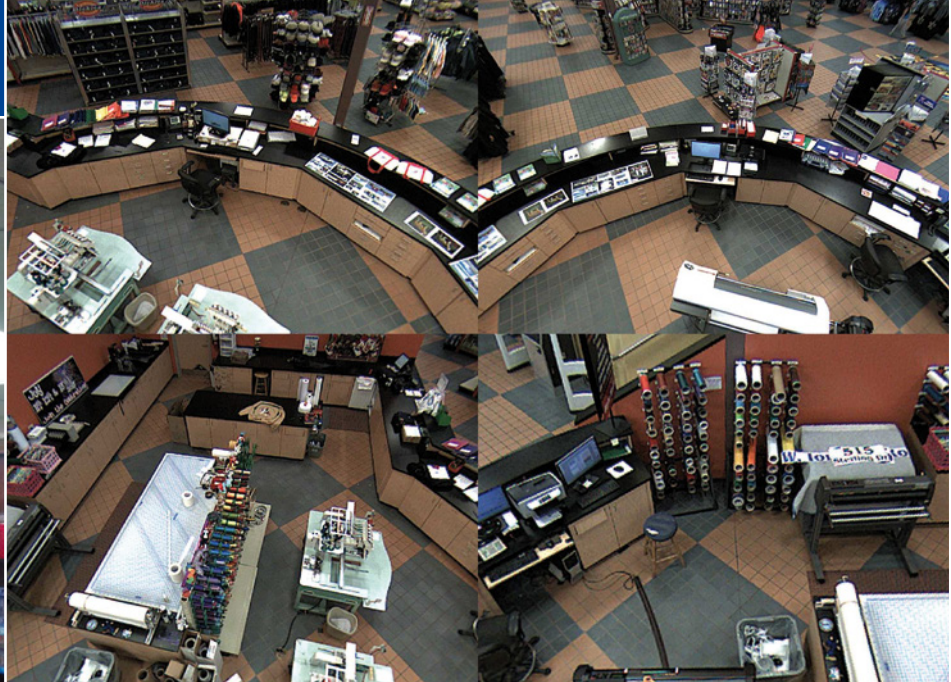
Q24 Hemispheric Camera: Quad-View