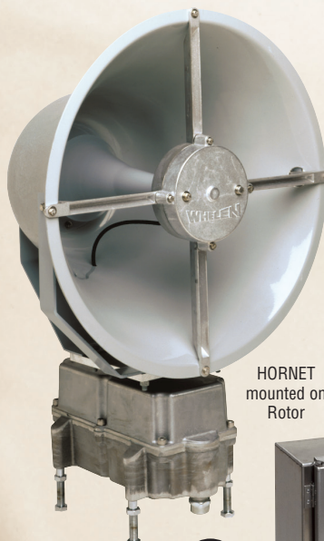
HORNET mounted on Rotor

Other features are dependant upon one or two-way controls. Whelen equipment can be interfaced with many different types of two-way radio communications products and systems. The following is offered as standard options. Contact the factory for special applications.