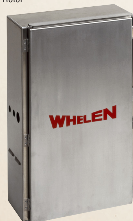
TYPE I Electronic Cabinet with optional Batteries (BSETHOR)

The following are available as standard options. BOLD BLUE indicates the Whelen Model: