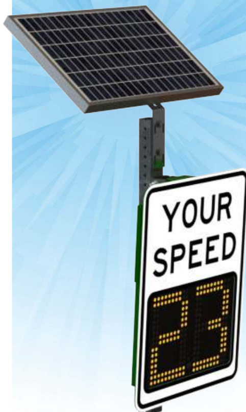
Part #: M75-009SE-000x