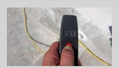
Substrate temperature in the shade

Temperature affects all aspects of the Flexcrete application. If the substrate temperature is too hot it will cause the water to leave the waterproofing too early and flash set. This can be offset by assuring a SSD (saturated surface dry) condition. This can cause delamination if applied to a dry substrate. If the polymers or the compound is too hot it can highly reduce the pot life to fifteen minutes. Generally if the temperature of the working material is between 65 and 75 degrees F. the working time can be a least 30 - 45 minutes.