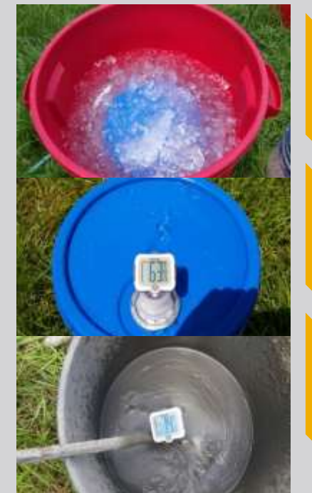
1 hour before