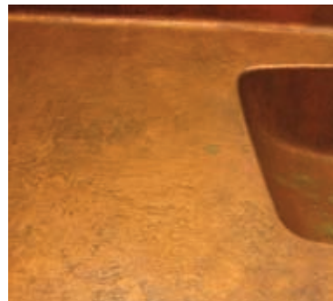
13.COPPER AND METAL