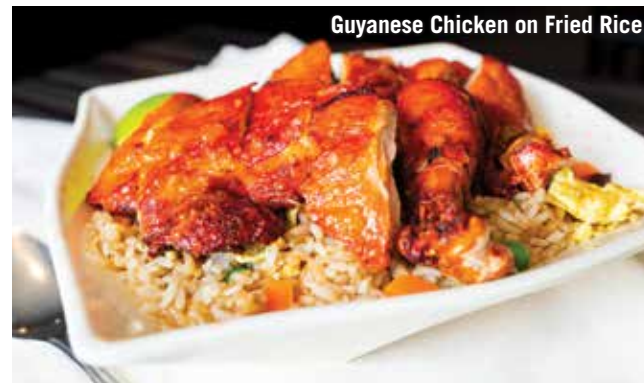
Guyanese Chicken on Fried Rice

! Spicy ! Veggie ! Spicy & Veggie HL House Special (Chicken, Shrimp & Beef)