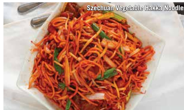
Szechuan Vegetable Hakka Noodle