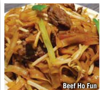
Beef Ho Fun