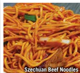
Szechuan Beef Noodles