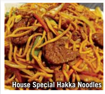
House Special Hakka Noodles