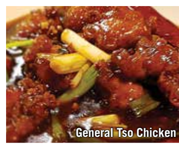
General Tso Chicken