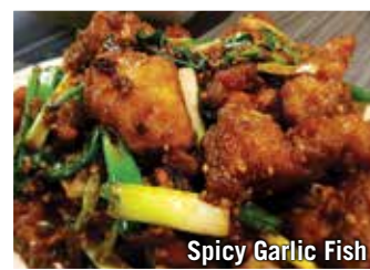
Spicy Garlic Fish