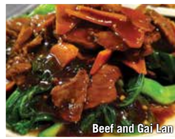
Beef and Gai Lan