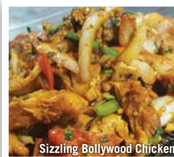
Sizzling Bollywood Chicken