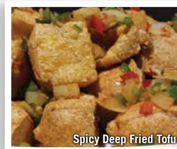
Spicy Deep Fried Tofu