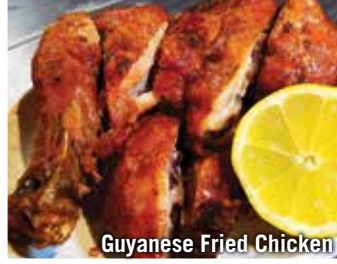
Guyanese Fried Chicken