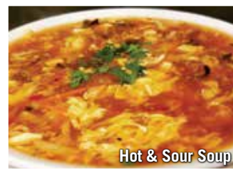
Hot & Sour Soup