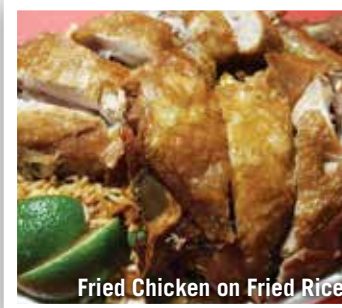
Fried Chicken on Fried Rice