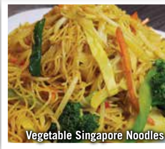
Vegetable Singapore Noodles

Spicy Veg Spicy & Veg HL House Special (Chicken, Shrimp & Beef)