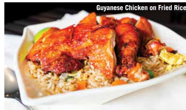
Guyanese Chicken on Fried Rice

! Spicy ! Veggie ! Spicy & Veggie HL House Special (Chicken, Shrimp & Beef)