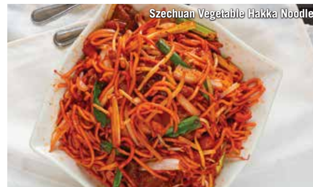
Szechuan Vegetable Hakka Noodle