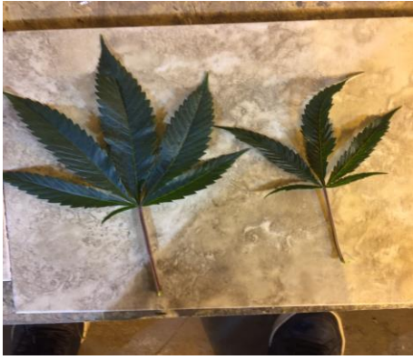
ACMPR 5 week Cannabis Trial